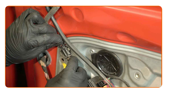
Detach the mirror adjuster connector from the door.