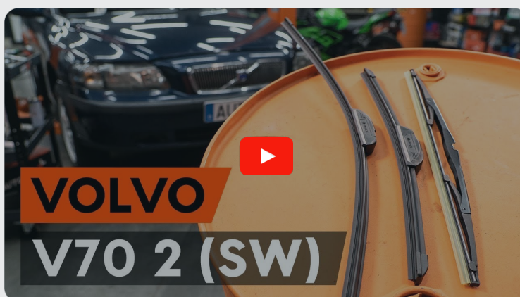
This video shows the replacement procedure of a similar car part on another vehicle