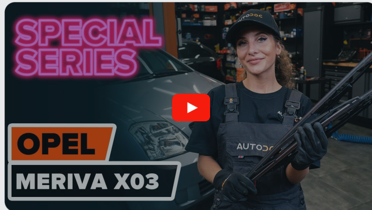
This video shows the replacement procedure of a similar car part on another vehicle