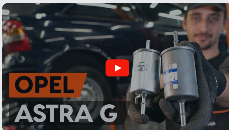
This video shows the replacement procedure of a similar car part on another vehicle