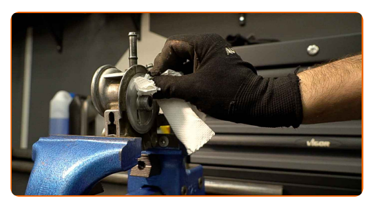
Clean the mounting seat of the cartridge.