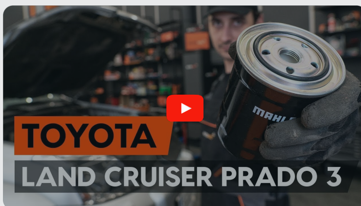
This video shows the replacement procedure of a similar car part on another vehicle