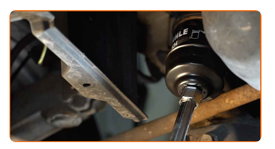
Unscrew the oil filter. Use the 76/14-F socket.