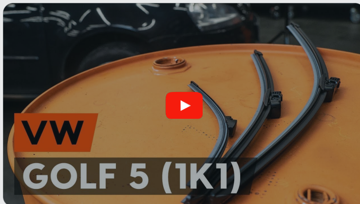
This video shows the replacement procedure of a similar car part on another vehicle