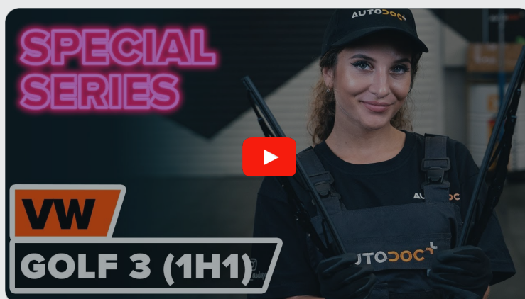
This video shows the replacement procedure of a similar car part on another vehicle