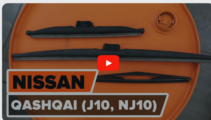
This video shows the replacement procedure of a similar car part on another vehicle