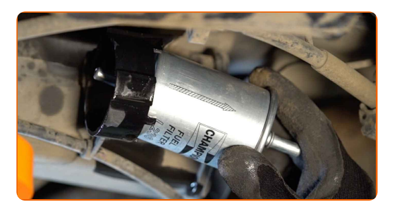
Install a new fuel filter.