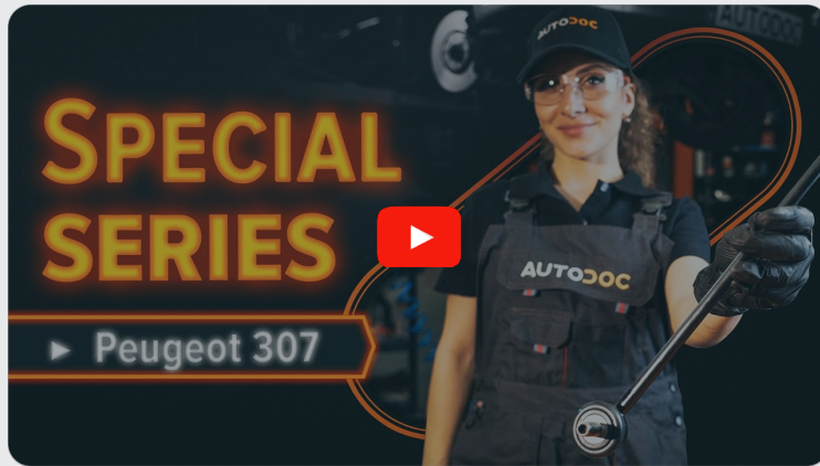
This video shows the replacement procedure of a similar car part on another vehicle