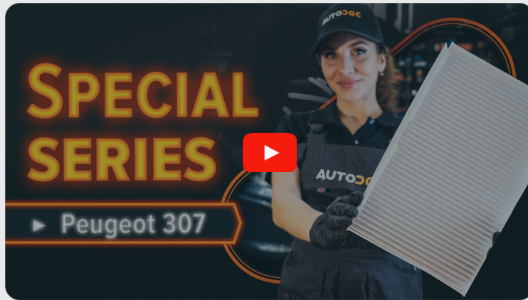
This video shows the replacement procedure of a similar car part on another vehicle