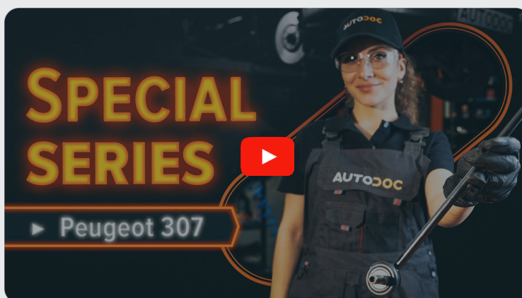
This video shows the replacement procedure of a similar car part on another vehicle