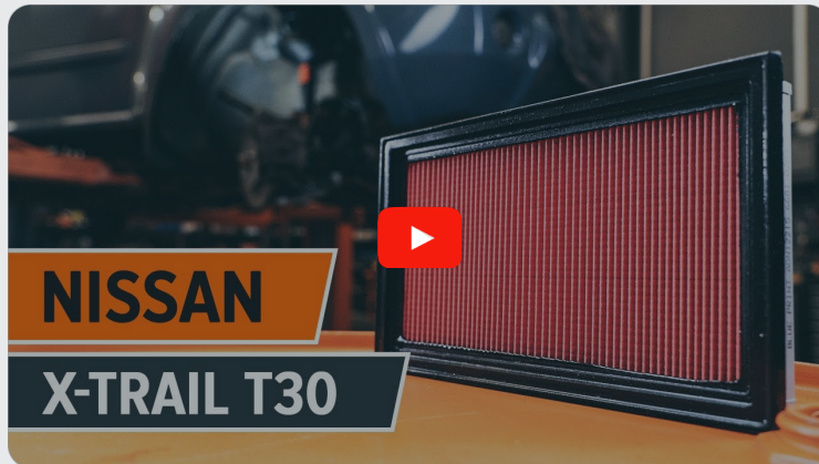
This video shows the replacement procedure of a similar car part on another vehicle