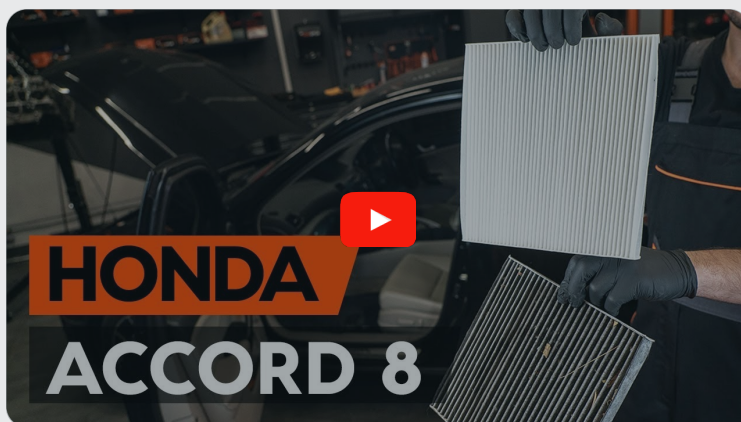
This video shows the replacement procedure of a similar car part on another vehicle