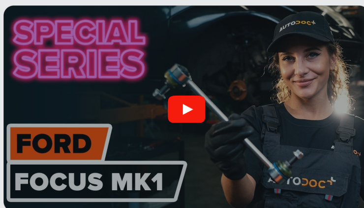
This video shows the replacement procedure of a similar car part on another vehicle