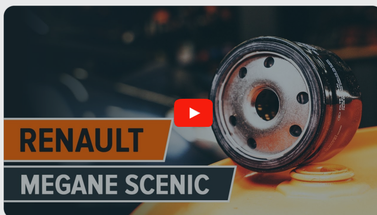
This video shows the replacement procedure of a similar car part on another vehicle