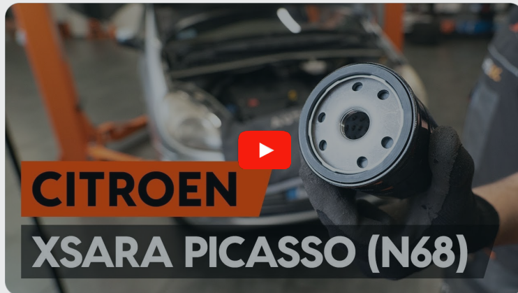
This video shows the replacement procedure of a similar car part on another vehicle