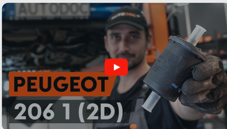
This video shows the replacement procedure of a similar car part on another vehicle