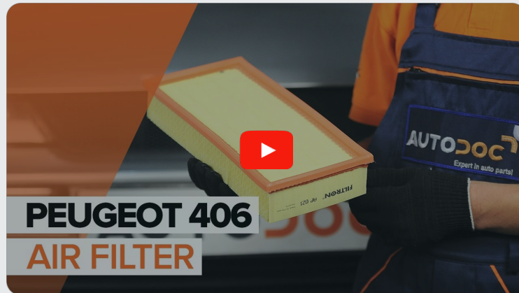
This video shows the replacement procedure of a similar car part on another vehicle