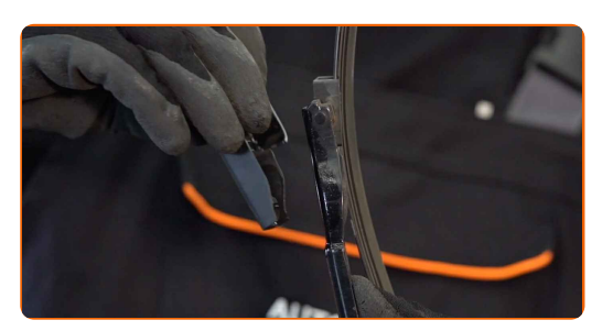
Remove the windscreen wiper arm nut cover.