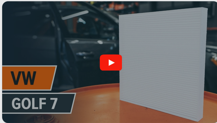
This video shows the replacement procedure of a similar car part on another vehicle