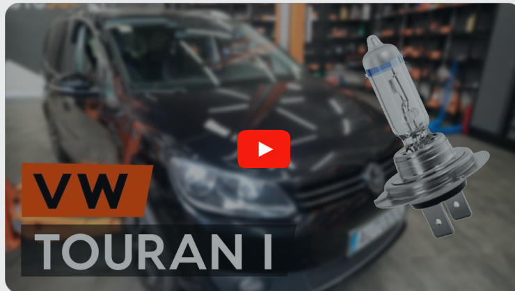
This video shows the replacement procedure of a similar car part on another vehicle