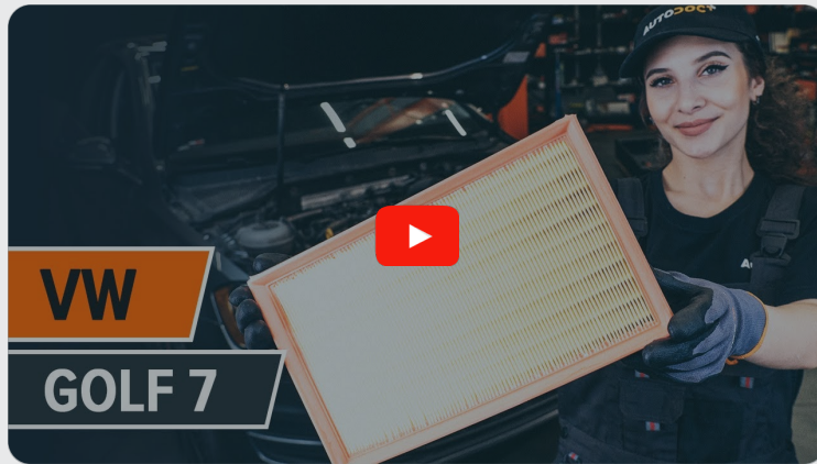
This video shows the replacement procedure of a similar car part on another vehicle